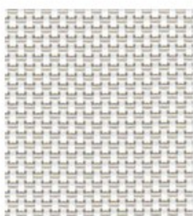
STYLE 4000 5% ECO/ALABASTER