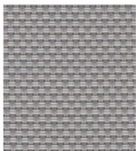
STYLE 4000 5% ECO/PEWTER