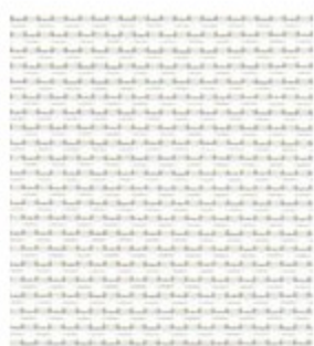
STYLE 4000 5% ECO/CHALK

As the only sun control fabrics in the market to use DOW's unique ECOLIBRIUM bio-based plasticizer, Styles 4000/4100 and 4400 combine the durability of vinyl coated polyester with the latest in green PVC technology. ECOLIBRIUM is a renewable alternative to traditional plasticizers that lowers greenhouse gas emissions as much as 40% vs existing PVC compounds. Style 4000/4100/4400 with DOW ECOLIBRIUM is phthalate-free, lead-free and RoHS compliant. These fabrics maintain all of the established benefits of traditional vinyl such as durability, clean ability and fabric longevity. Styles 4000/4100 and 4400 may also be used in exterior shading systems.