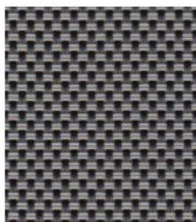
STYLE 4000 5% ECO/ASH