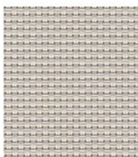
STYLE 4000 5% ECO/PEBBLESTONE