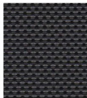
STYLE 4000 5% ECO/EBONY