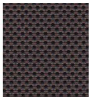
STYLE 4000 5% ECO/TOBACCO